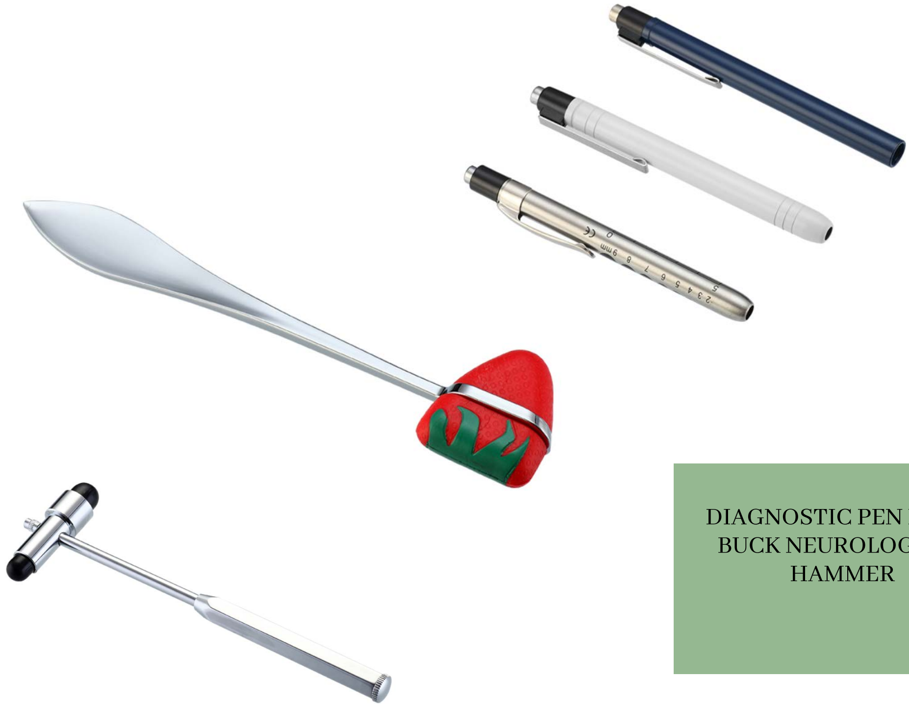
DIAGNOSTIC PEN LIGHT BUCK NEUROLOGICAL HAMMER